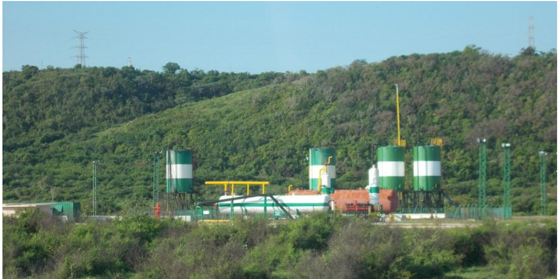
Figure 3. Ground level view of Santa Cruz oil field operation