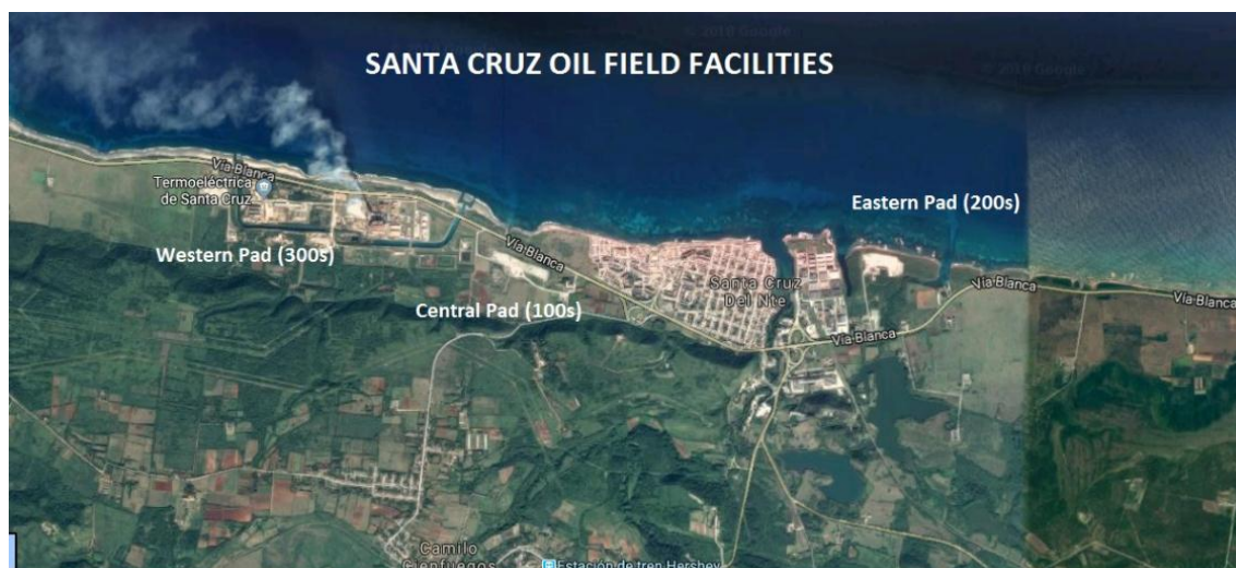
Figure 2. Map view of Santa Cruz oil field facilities

Melbana has exclusive right to study and negotiate a contract over the Santa Cruz field